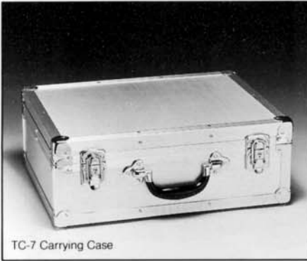
TC-7 Carrying Case

The TC-7 is a case specially designed for the Sanken CMS-7s microphone, CMS-MBB (I or II) power supply and matrix box, GS-7 suspension with hand grip, WS-7 windscreens, WJ-7 windjammer, and four cables (SC-71, SC-72, and two SC-73s).