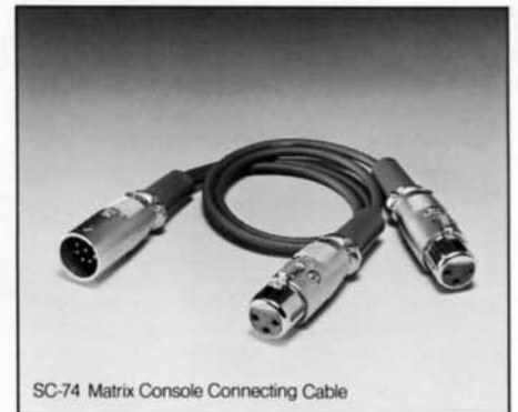
SC-74 Matrix Console Connecting Cable

The SC-74, which is used to edit M-S stereo recordings, allows the stereo outputs from a mixing console to be fed back into the CMS-MBB for generating L-R output. This also allows narrowing of the stereo image, if desired, as well as transforming the stereo signal to mono (see Application Notes).