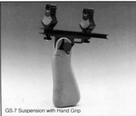
GS-7 Suspension with Hand Grip

Custom designed for the Sanken CMS-7s microphone, the GS-7s features a shock absorbing material between the hand grip and microphone mount for maximum reduction of handling vibrations. Its drilled 10mm (3/8 in.) screw allows the CMS-7s to be mounted on a boom or stand. (Note: The GS-7s can also be ordered with hand grips made by Rycote.)